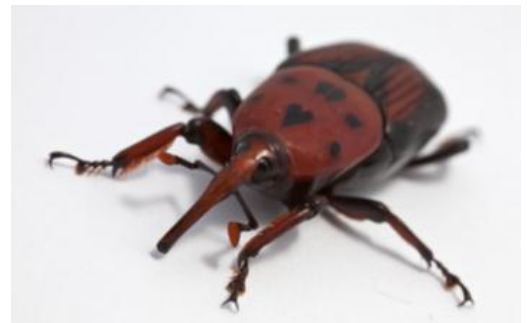
Red Palm Weevil, Palm Weevil or Rhynchophorus ferrugineus.

Its homeland is the Indonesian region. In an intact ecosystem it does not pose a problem. It has a large number of counterparts ranging from insects to reptiles and mammals. This circumstance seems to be the reason for the enormously high reproduction rate. The high reproduction rate is necessary for the existence of the species. The situation is even more dramatic when the Red Palm Weevil is introduced into regions where there are no counterparts adapted to it.